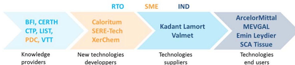
Figure 1: Consortium description

The objective of the European SpotView project – “Sustainable Processes and Optimized Technologies for Industrially Efficient Water Usage” –is to develop and demonstrate innovative, sustainable and efficient processes and technology components in order to optimize the use of natural resources, especially water, in three industrial sectors (Dairy, Pulp and Paper, and Steel).